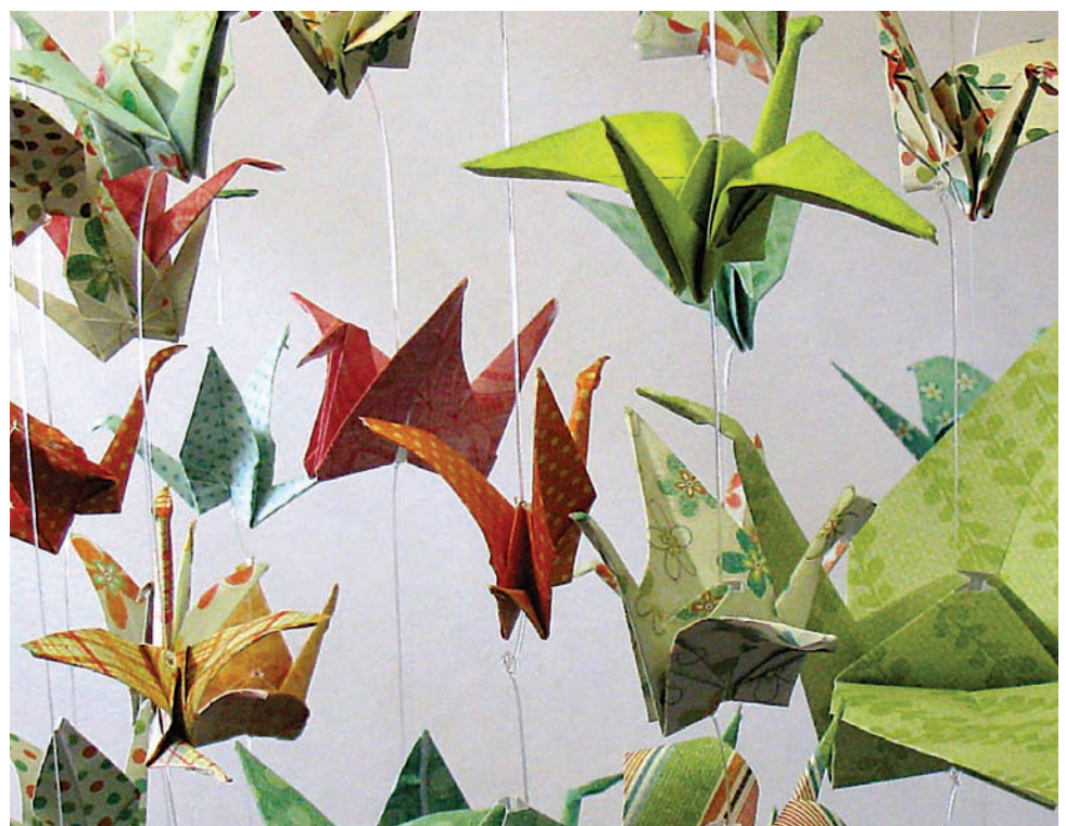
ARTWORK / HOME FOR LITTLE WANDERS / VOICES AND VISIONS